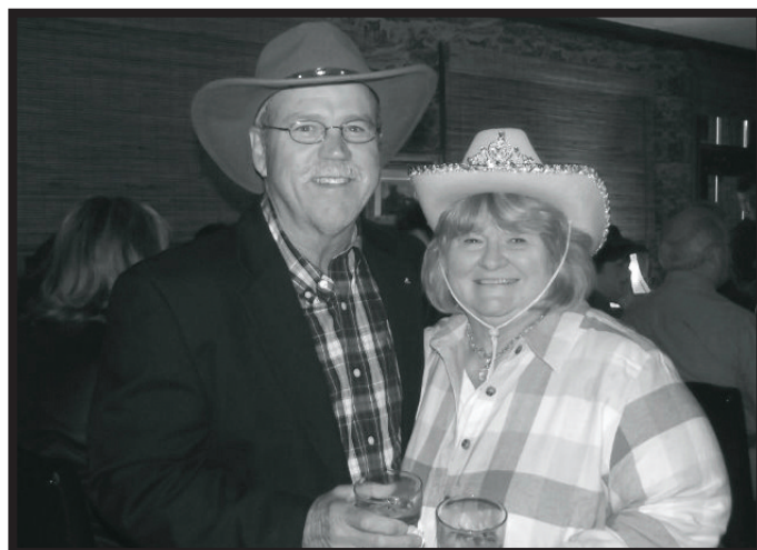
The Websters Back in the Saddle